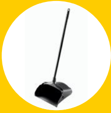
EXECUTIVE SERIES™ LOBBY PRO® DUST PAN FG253100BLA