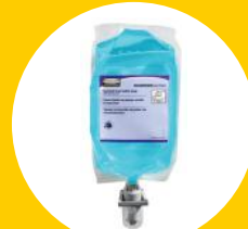
AUTOFOAM REFILL - ENRICHED HAND SOAP WITH MOISTURIZERS FG750112