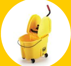
35 QT WAVEBRAKE® DOWN-PRESS BUCKET AND WRINGER FG757788YEL