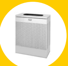
SILHOUETTES LARGE RECTANGLE CONTAINER FGSR185SPL