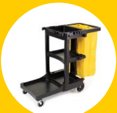
JANITORIAL CLEANING CART – TRADITIONAL FG617388BLA