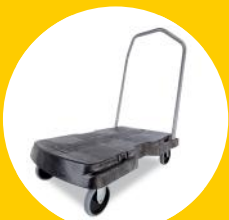
TRIPLE TROLLEY WITH ERGONOMIC HANDLES FG440100BLA