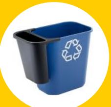
RECYCLING WASTEBASKET WITH SIDE BIN FG295673BLUE AND FG295073BLA