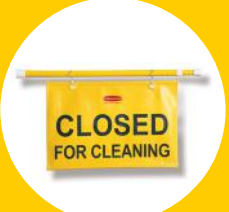
EXTENDABLE "CLOSED FOR CLEANING" HANGING SIGN FG9S1500YEL