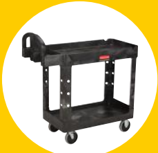
2-SHELF HD UTILITY CART WITH ERGO HANDLE AND LIPPED SHELF, MEDIUM FG452088BLA