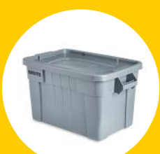
BRUTE® TOTE STORAGE BIN WITH LID FG9S3100GRAY