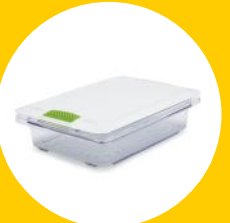
FRESHWORKS™ PRODUCE SAVER CONTAINER AND LID 2052983 AND 2052934