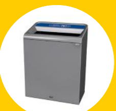
CONFIGURE™ 1-STREAM MIXED RECYCLING CONTAINER 1961508