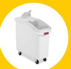
PROSAVE® INGREDIENT BIN WITH 32 OZ SCOOP FG360088WHT