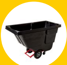
UTILITY TILT TRUCK - ROTOMOLDED FG130400BLA