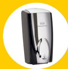
AUTOFOAM TOUCH-FREE DISPENSER FG750411