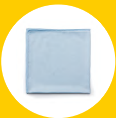
HYGEN™ GLASS/MIRROR MICROFIBER CLOTH FGQ63000BL00