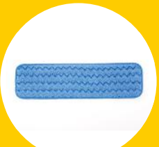
HYGEN™ MICROFIBER WET PAD FGQ41000BL00