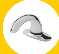
AUTOFAUCET® CENTER SET MILANO 1782743