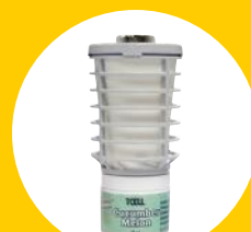
TCELL™ REFILL - CUCUMBER MELON FG402470