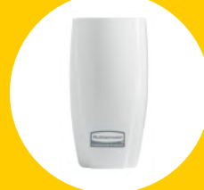
TCELL™ DISPENSER 1793547