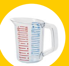
BOUNCER® MEASURING CUP FG321500CLR