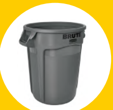
BRUTE® CONTAINER WITH VENTING CHANNELS FG263200GRAY