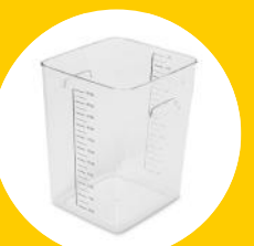
SQUARE STORAGE CONTAINER FG632200CLR