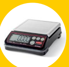
HIGH PERFORMANCE DIGITAL PORTIONING SCALE 1812590